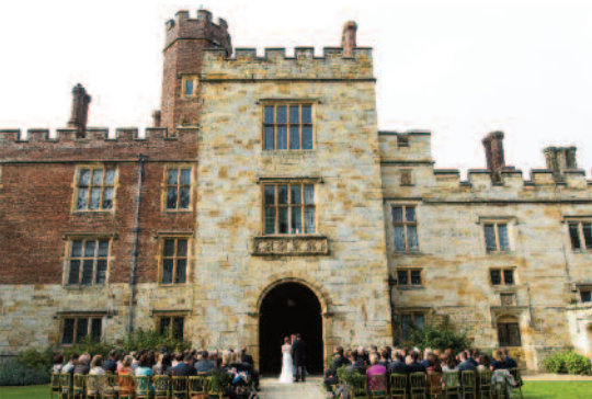
The Inner Courtyard