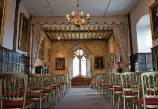
The Sunderland Room