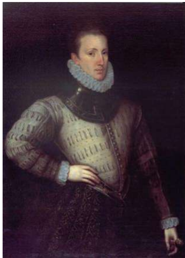
Sir Philip Sidney

His wife went to nurse him but the wound turned gangrenous and within a month he