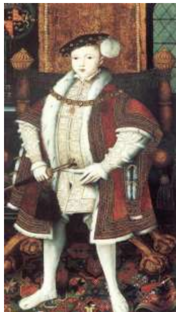
King Edward VI

Edward, despite his age, was a committed Protestant and took his responsibilities as head of the new Church of England seriously. Along with his half sisters, Mary and Elizabeth, he received a very good education. He could read Latin, Greek and French, studied Mathematics and could play the Lute. Edward also participated in the normal pastimes of a noble and child of Tudor England. He rode, hunted, tilted in the ring, played tennis and practised archery. He was also a quiet and serious child. He balanced the normal pastimes with an awareness of the need to care for his soul.