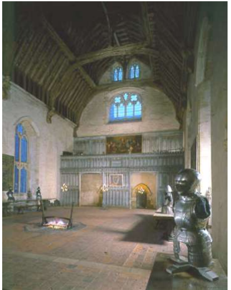
The Baron's Hall

In the 16 th century the countryside around Penshurst was dominated by the forest, called the Weald. There would have been a mixture of farming, both crops and animals. Forest based industries such as timber and charcoal making were important and supported the mining and refining of iron ore.