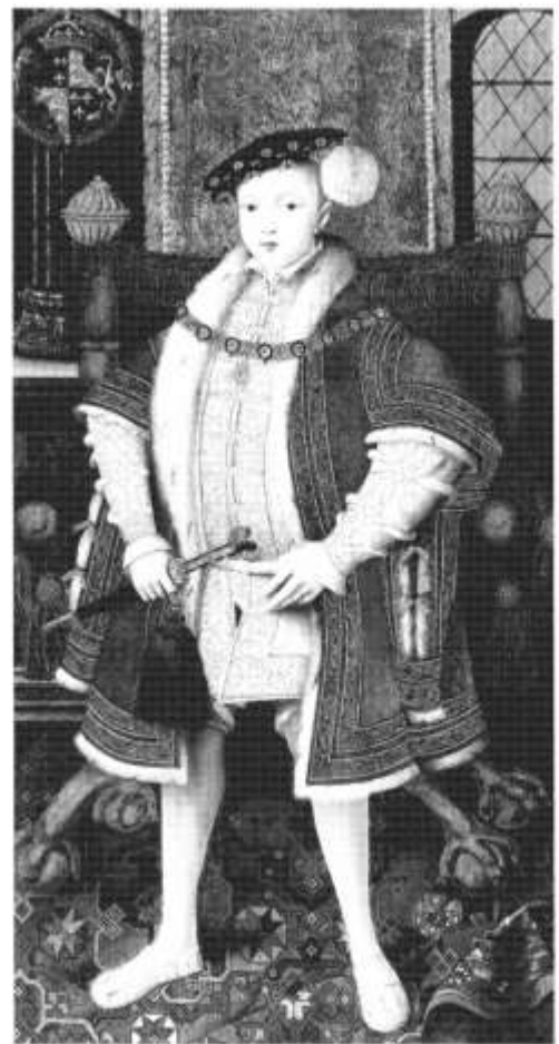
Left to right, top to bottom Henry VIII, Henry VII, Elizabeth I, Edward VI