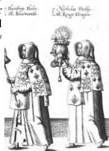
From Sir Philip Sidney's funeral scroll

Seven hundred mourners attended his funeral at St Paul's Cathedral on 16th February 1587 and seldom has a young man of thirty-two been more widely and sincerely mourned. The helmet carried in front of his coffin bearing the Sidney porcupine badge can be seen in the Nether Gallery. He was accorded the honour of a state funeral – the first commoner to receive such a tribute, which was not to be repeated until the death of Nelson and later Sir Winston Churchill (who had Sidney