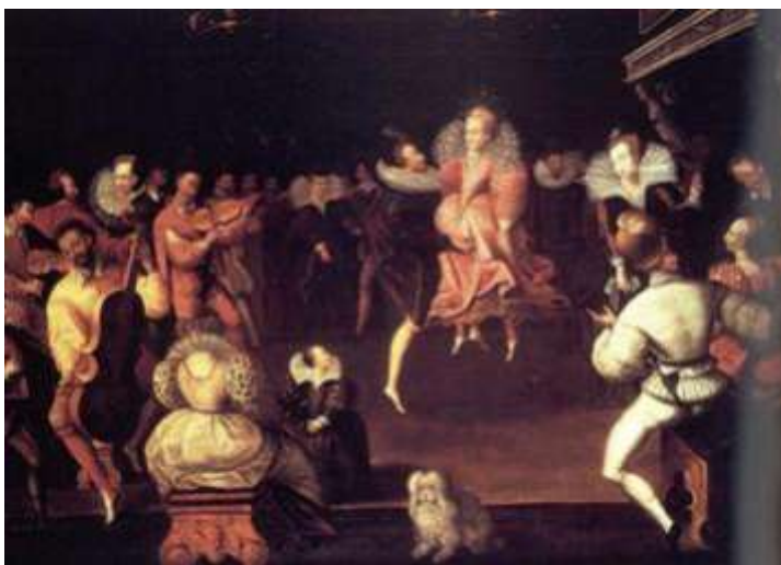
Queen Elizabeth I dancing La Volta with Robert Dudley, Earl of Leicester

“If I were a milkmaid with a pail on my arm, whereby my private person might be a little set by, I would not forsake that poor and single state to match with the greatest monarch”.