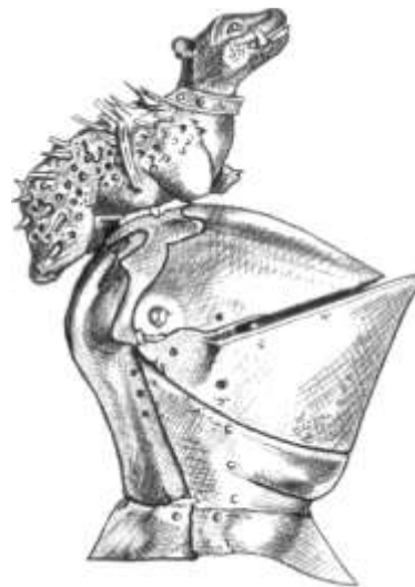
Philip Sidney's Funeral Helm